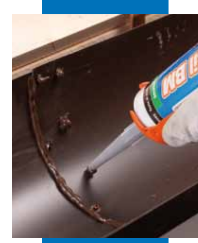
Sealing the heads of rivets