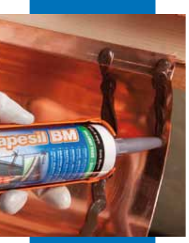
Extruding Mapesil BM on the lower sheet of metal before overlaying with another sheet

Mapesil BM is available in grey, copper, dark brown and transparent.